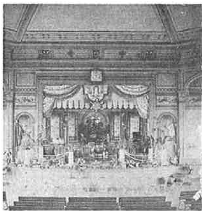
Town Hall Stage Decorated for Graduation 1898