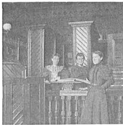
Public Library when located in G.A.R. Hall, now Assessors' Office